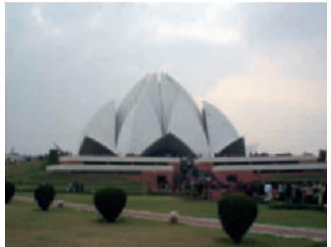
Bahai Temple Delhi

We visited the Congress Centre where the stage is waiting for the Award Ceremony on 15 November and other monuments like the