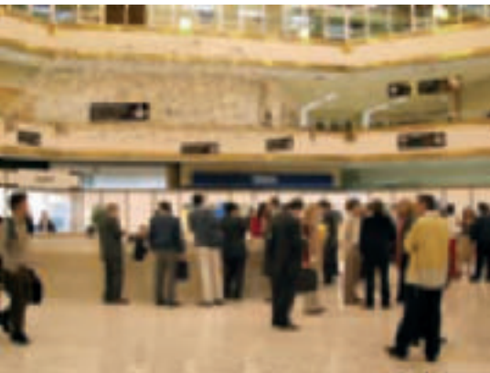
Reception of Attendants

This has been the first scientific activity dealing with Project Management and Engineering Costs, held in Spain, having the official support of both International Organizations. During previous Congresses, the subject of Project Management was treated as a specific Thematic Area, appearing now as an exclusive event.