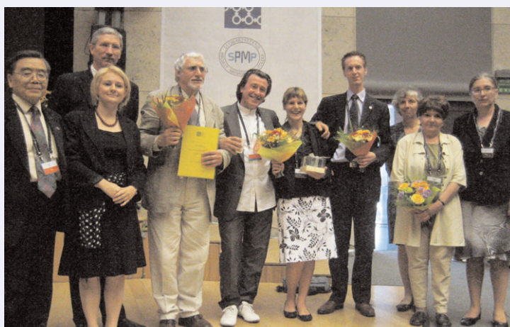
IPMA Research Awards Ceremony, 19 th of June 2007, Cracow